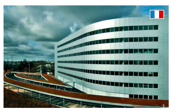
Siege de Etde, Saint Herblain