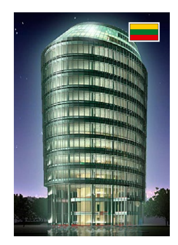
Green Hall, Vilnius