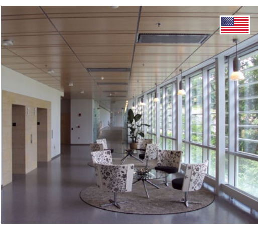
Astra Zeneca, Boston